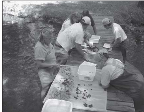
Students examine and identify macroinvertebrates gathered as part of the training.

Hoosier Riverwatch Volunteer Water Quality Monitoring "Basic" Training introduces citizens and educators to water quality monitoring utilizing hands-on habitat, chemical, and biological assessment methods. Participants gain experience and skills in the use of chemical monitoring kits and aquatic in-